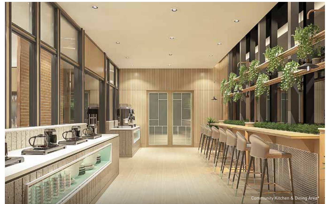
Community Kitchen &amp; Dining Area*

Besides a comprehensive variety of facilities and amenities, a heightened focus on community-building underlines all activities at Komune Living & Wellness, with residents encouraged to both participate in and help organise them. Full use will be made of Taman Tasik Permaisuri with daily morning and evening workouts, tai chi sessions and group walks, while the property's warm, inclusive community spirit will be enlivened with regularly scheduled workshops, talks, courses, and external excursions.