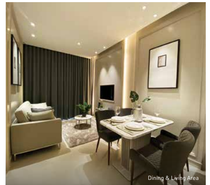
Dining & Living Area