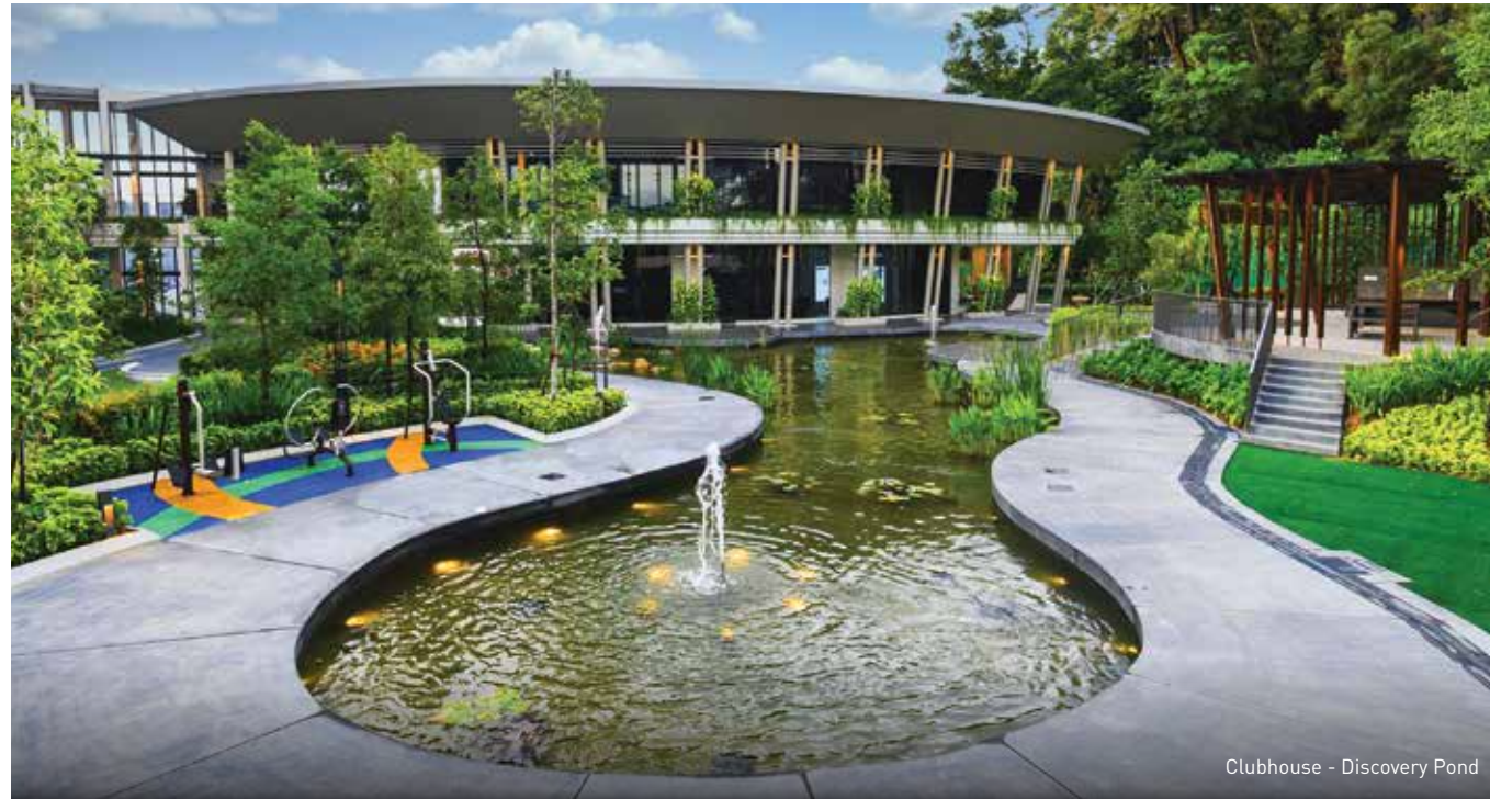
Clubhouse - Discovery Pond

The notion of multi-generational homes has always been imbued in Asian culture but recently, this practice is becoming popular around the world. The Goodwood Residence at Bangsar South showcases everything you need in a family-focused home that is capable of housing several generations, with units ranging from 947 square feet to 2,002 square feet.