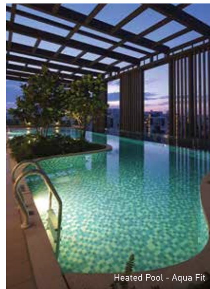
Heated Pool - Aqua Fit