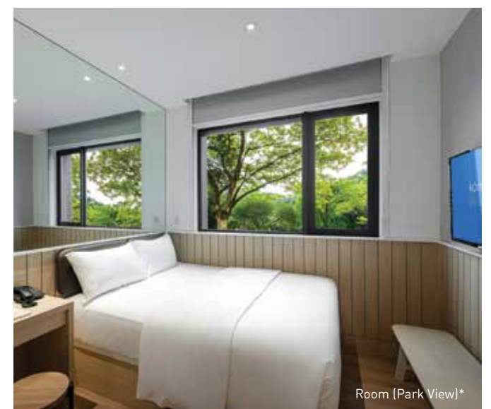
Room (Park View)*