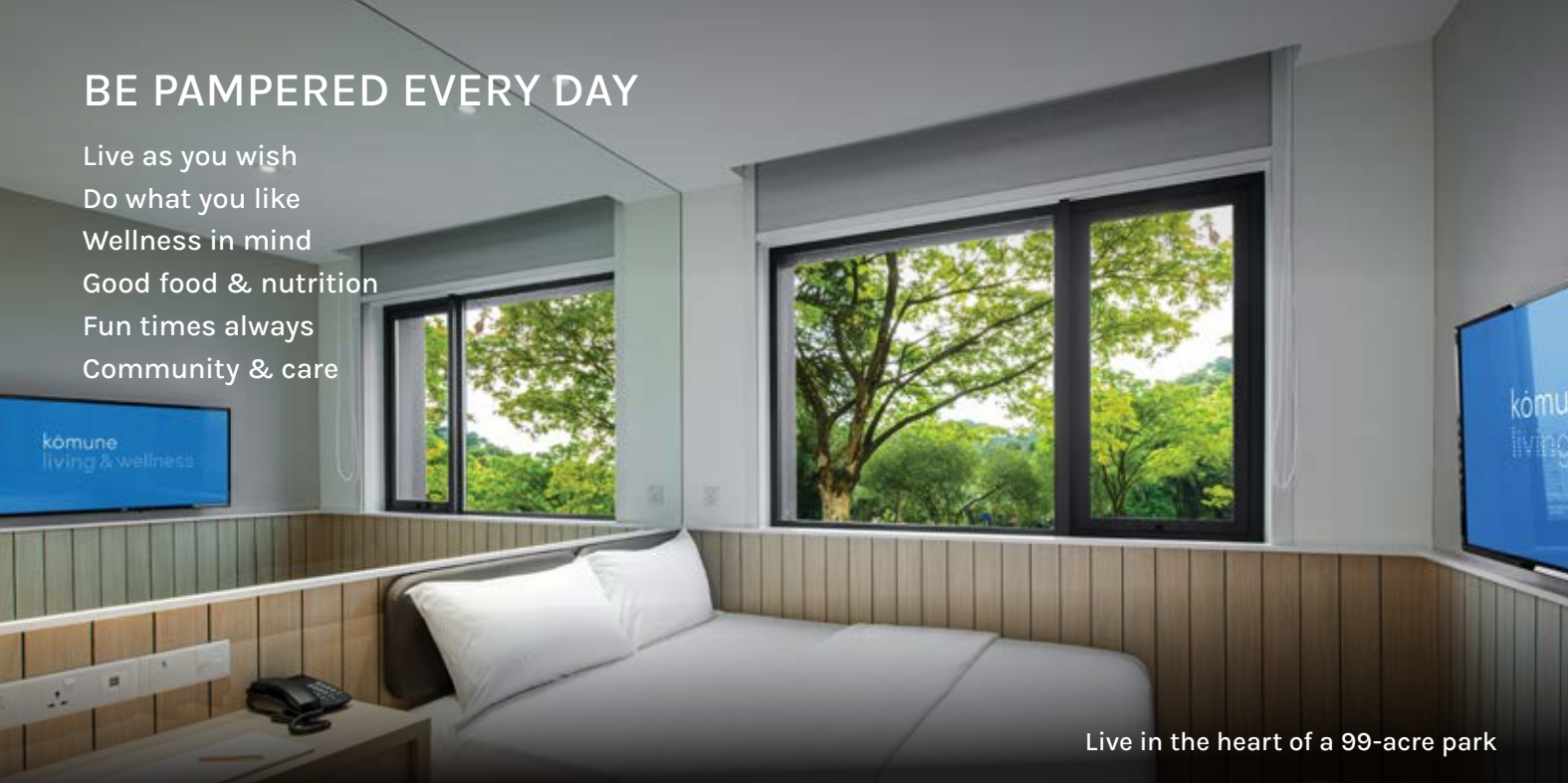
Live in the heart of a 99-acre park