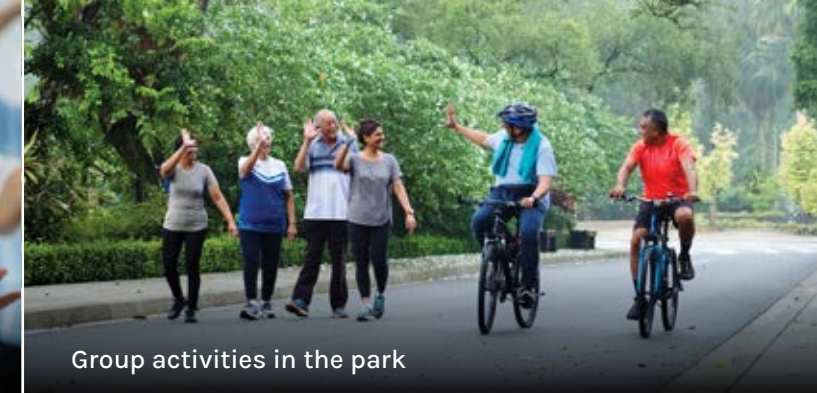
Group activities in the park