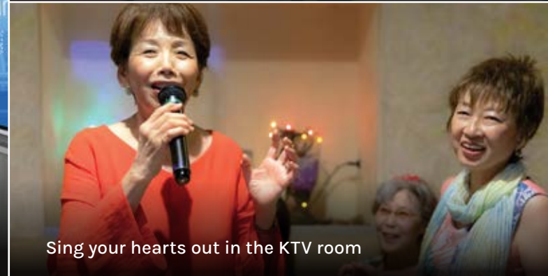
Sing your hearts out in the KTV room