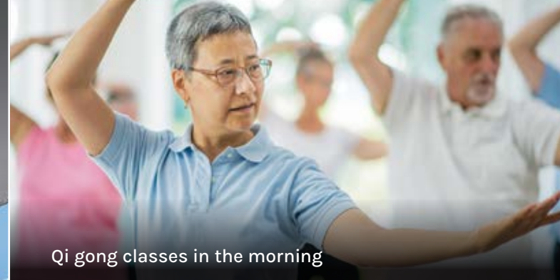
Qi gong classes in the morning