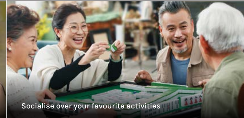
Socialise over your favourite activities