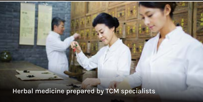
Herbal medicine prepared by TCM specialists