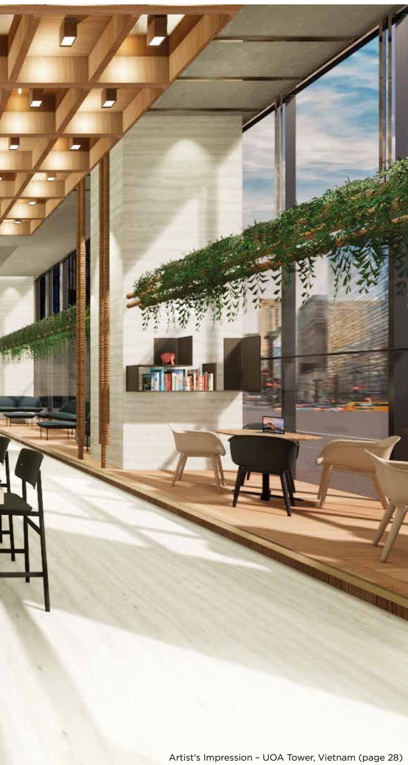
Artist's Impression - UOA Tower, Vietnam (page 28)