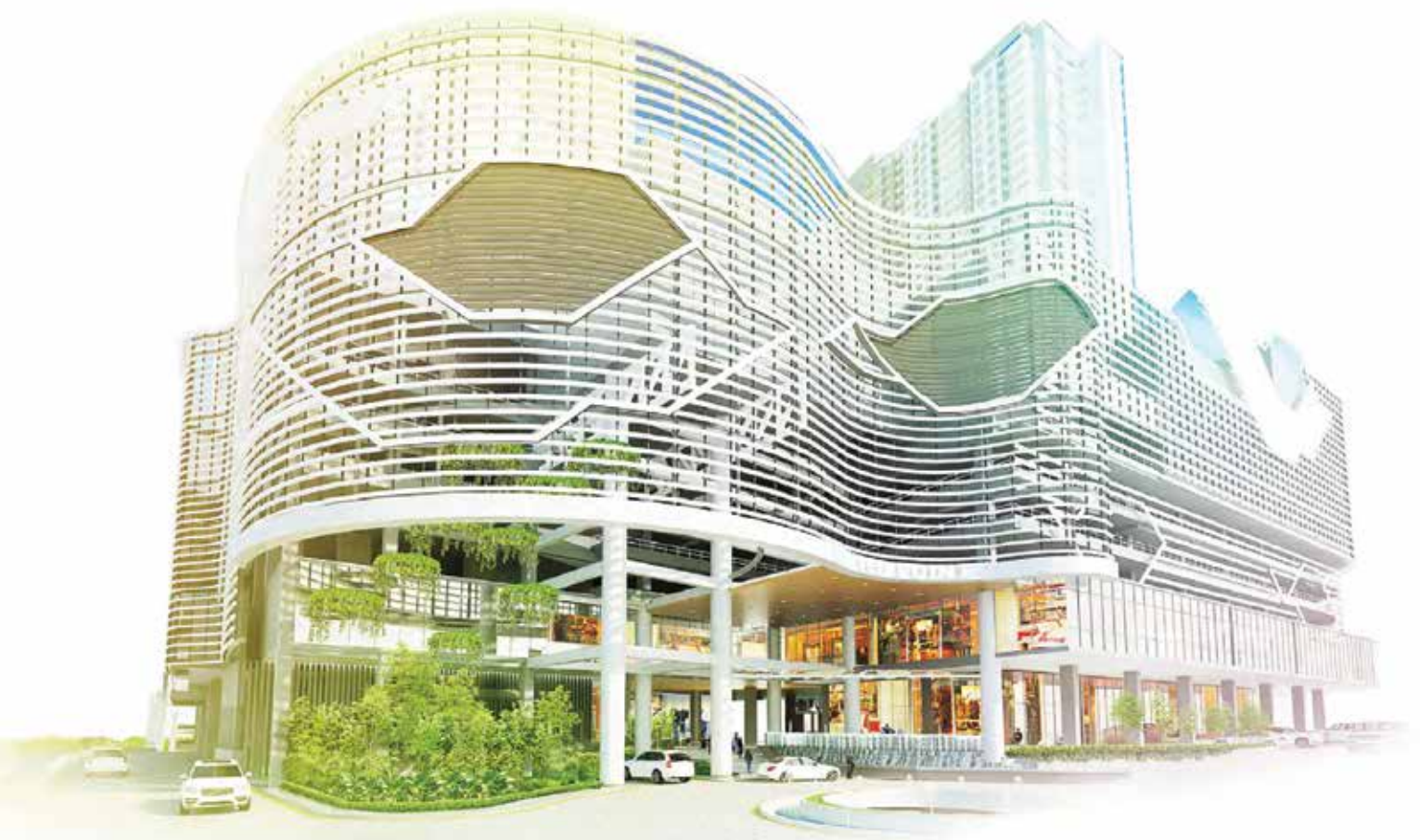
Artist's Impression - Exterior Façade

These retail enjoyments will arrive in the form of dining, grocery shopping, family entertainment, children's