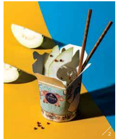
What: Mr Chew's Take Away G&T

Located on the first level of a Petaling Street shop lot, Botak Liquor specialises in cocktails crafted from clear spirits and with a clever use of botanical flavours. This fragrant and delicious pisco base cocktail, for instance, is shaken with organic starfruit, a sprinkle of fresh curry leaves, lemon, and local sugarcane sugar.