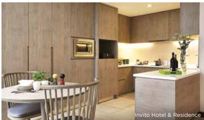
Invito Hotel & Residence

Following the end of Fraser’s management term in September 2019, UOAH took over the operations of Capri and transitioned it into Invito Hotel & Residence. Establishing the Invito brand as elegant yet inclusive, it stands out as a welcoming and approachable leisure venue with 240 spacious room and apartment spaces, tasteful designs, thoughtful amenities, spectacular views, and delightful facilities, specially catered to fulfil mid to longer term stays.