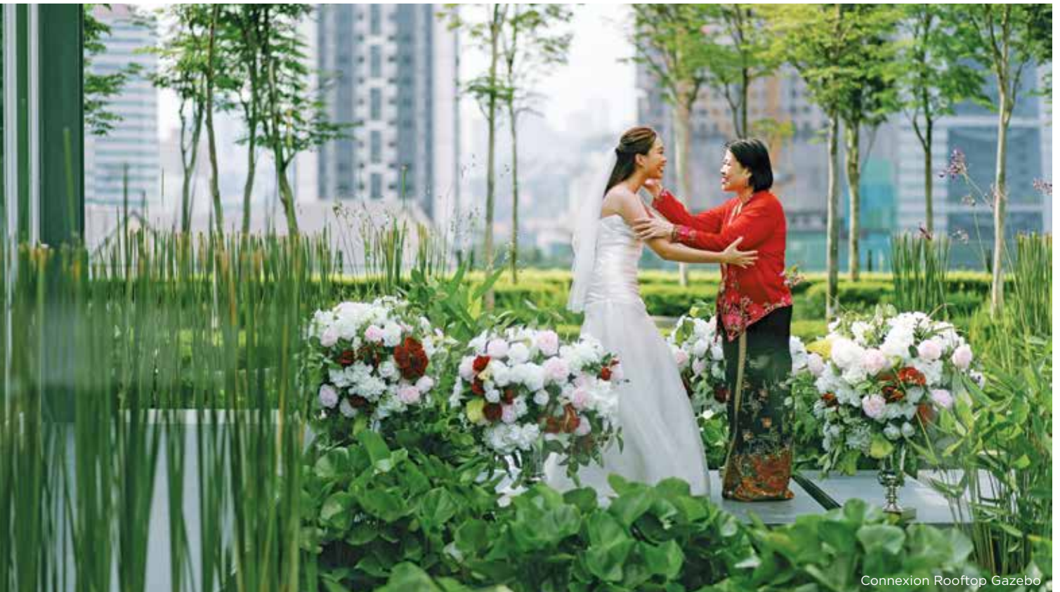
Connexion Rooftop Gazebo