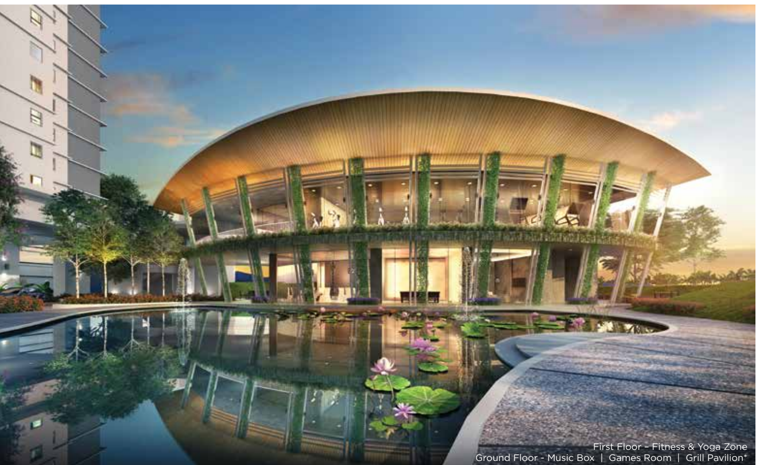
First Floor - Fitness & Yoga Zone Ground Floor - Music Box | Games Room | Grill Pavilion*