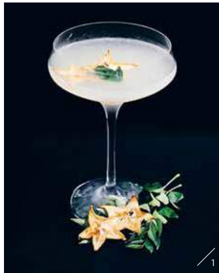
What: Starfruit x Daun Kari