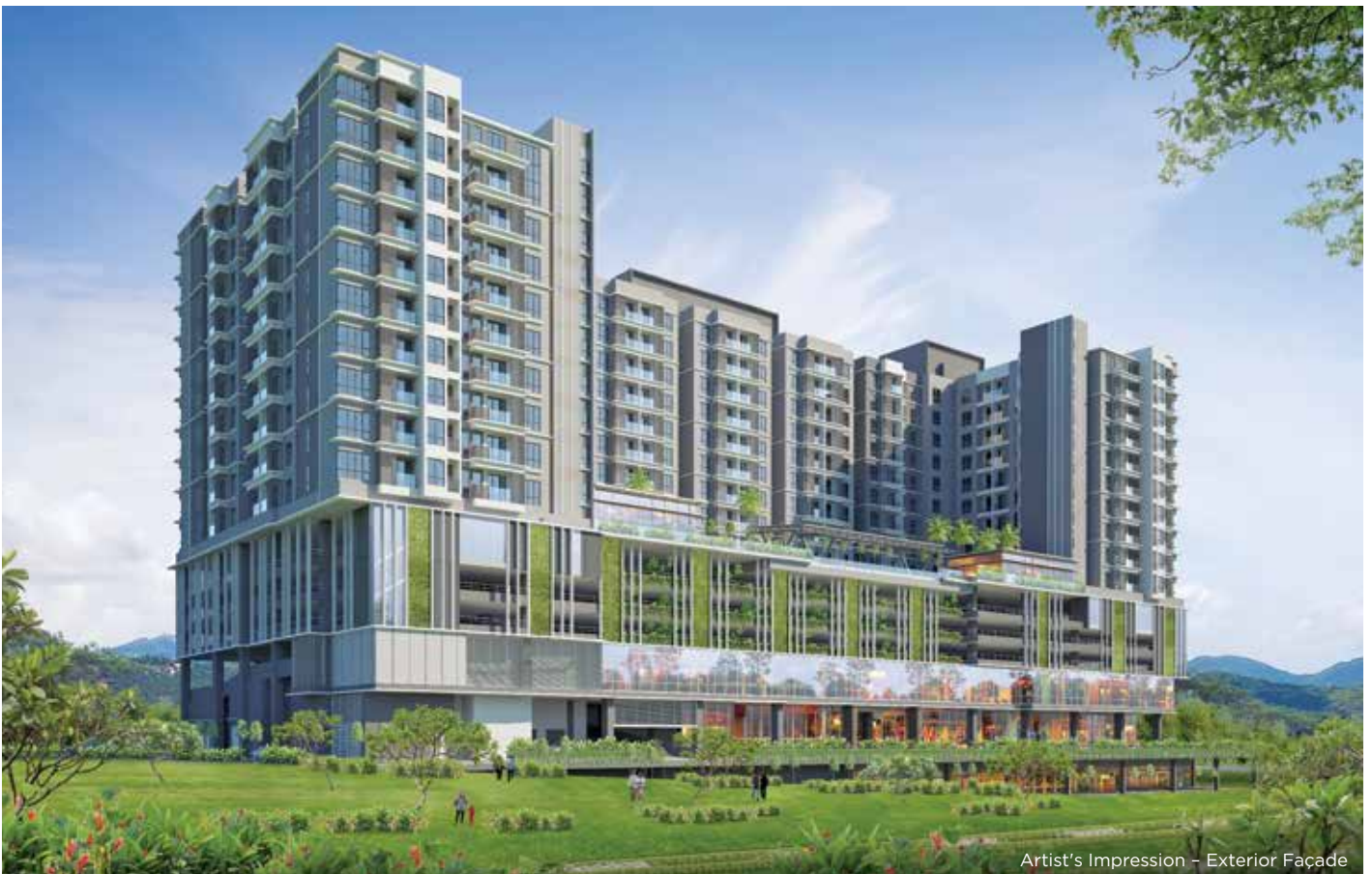
Artist's Impression - Exterior Façade

www.uoa.com.my/property/details/golden-pines/