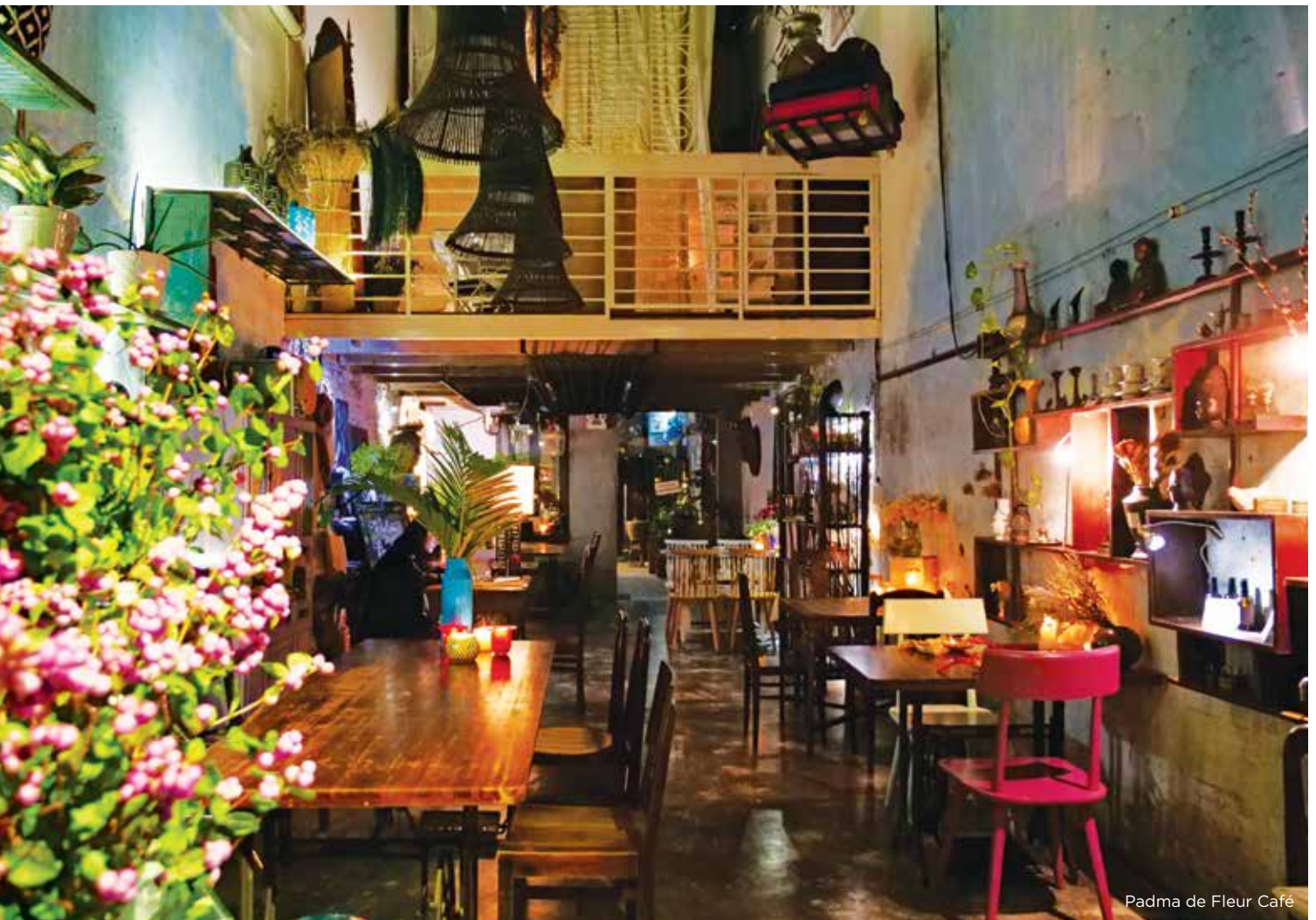
Padma de Fleur Café

Ho Chi Minh City (HCMC) is justifiably famous for its distinctive renditions of Vietnamese dishes - dark, semi-sweet pho broths laced with herbs, bean sprouts, and chilli sauce; and snack-sized banh xeo savoury pancakes, to name a few - but there is so much more to be discovered within the city. In this fast-paced, buzzing financial hub, the tastes of local Vietnamese have rapidly expanded to seek out restaurants and cafés of a less conventional kind.