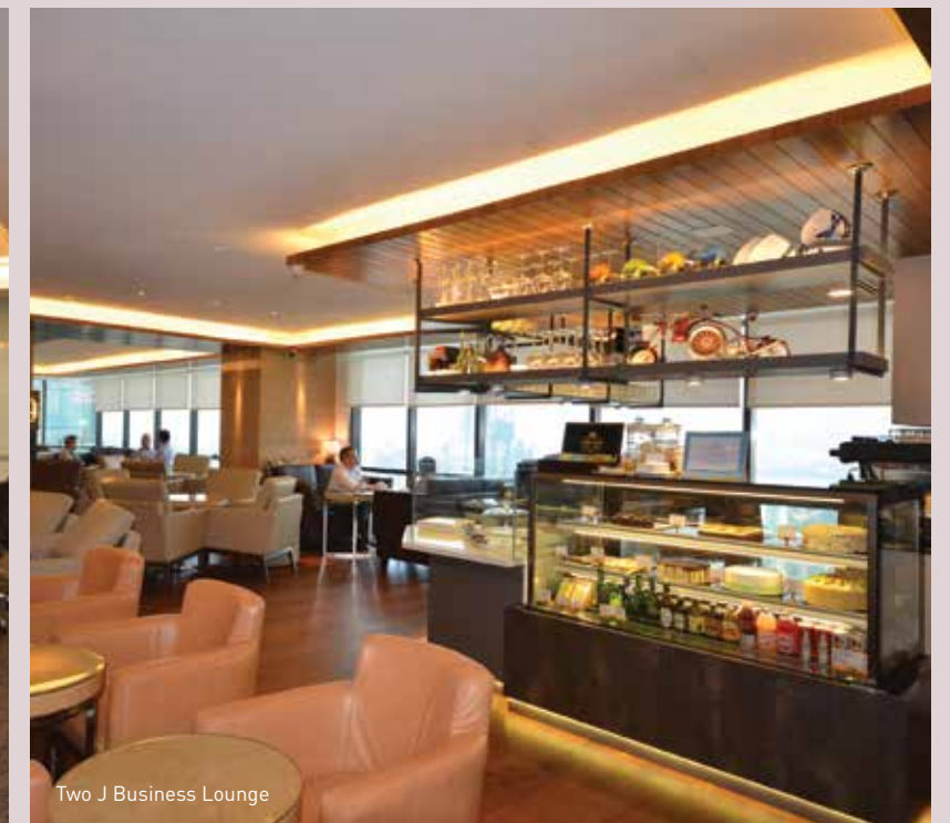
Two J Business Lounge