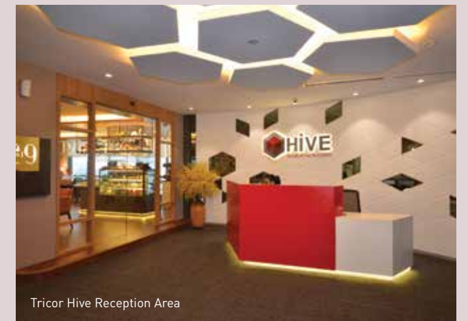
Tricor Hive Reception Area