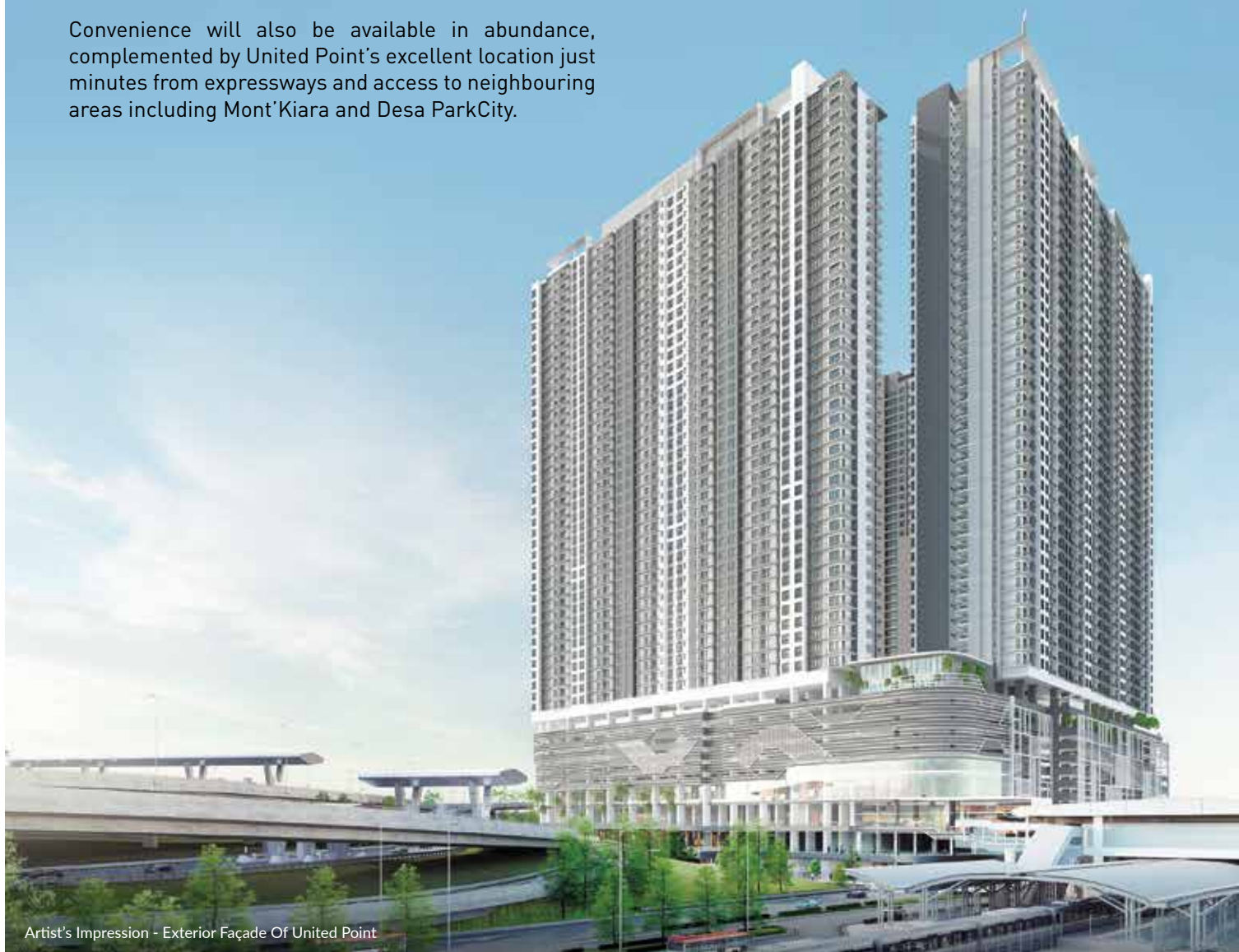
Artist's Impression - Exterior Façade Of United Point

📄 www.usa.com.my/property/residential/sales/current-projects/umited-point-residence