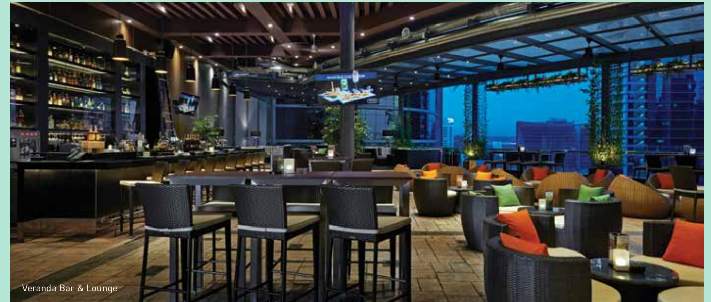
Veranda Bar & Lounge

the impressive wrap-around balcony or head to the long bar to unwind over a meal, served by our friendly and helpful resident bartenders – a leisurely experience is guaranteed here. Groups are also well hosted in the comfy sofas created for lounging and laid-back conversation.