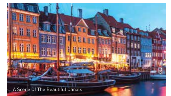
A Scene Of The Beautiful Canals

Cleanliness-obsessed citizens, a prominent recycling culture, eco-friendly practices, organic foods and electric vehicles – Copenhagen is as green a city as it gets. By year 2025, it plans to be the world's first carbon-neutral capital.