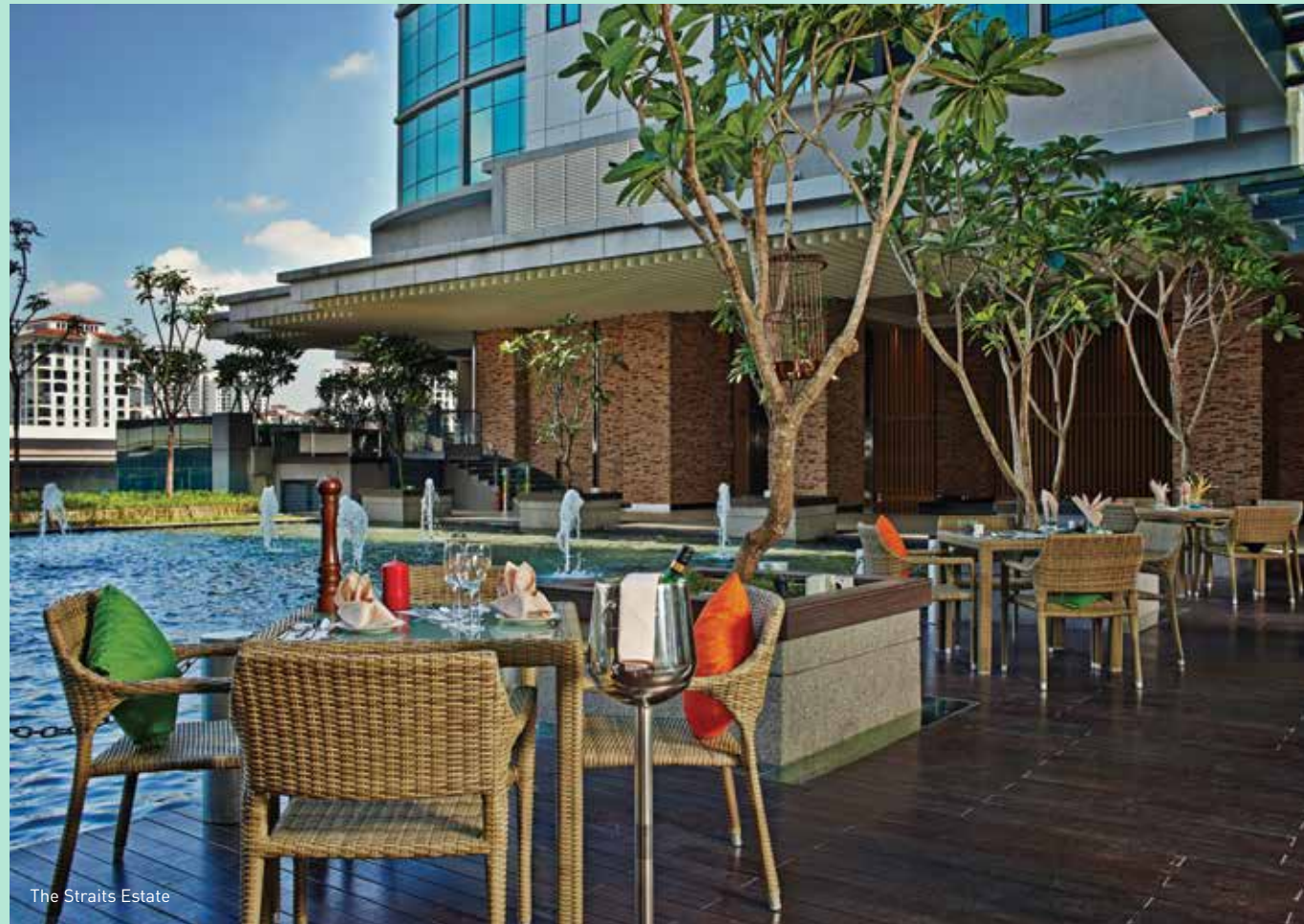
The Straits Estate

This unique all day dining restaurant offers a delicious selection of traditional dishes and popular street food, with an ambience that is richly inspired by Malaysia's Straits heritage. Hotel guests and visitors are welcome to indulge in The Straits Estate's rich melting pot of cuisine, headlined by signature regional dishes that are bound to satiate the taste buds of those who seek to enjoy the richness of flavours synonymous with local favourites.