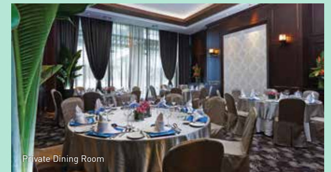
Private Dining Room