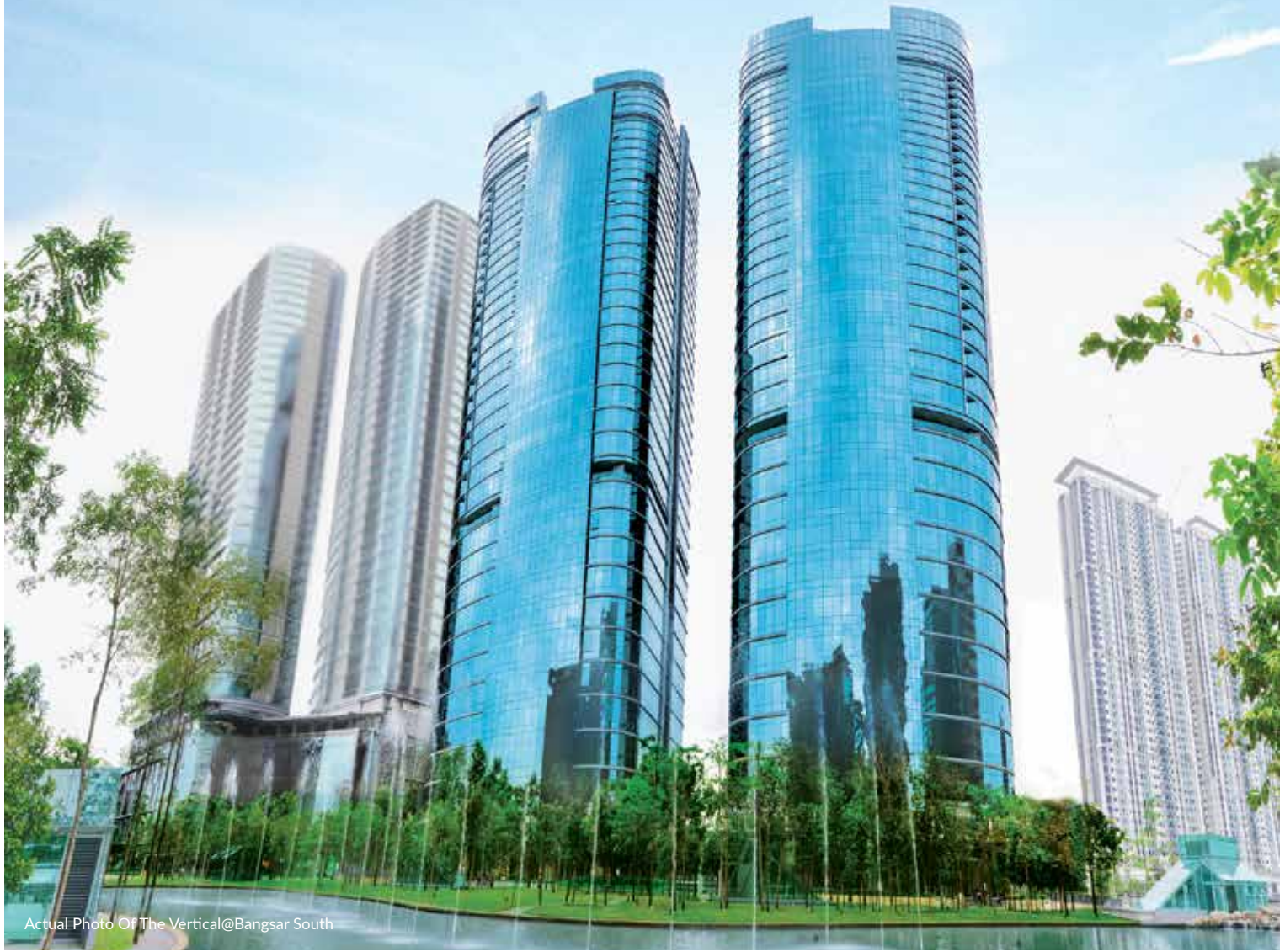
Actual Photo Of The Vertical@Bangsar South

Every UOA commercial building is crafted with spatial flexibility, accessibility, interconnectivity and world-class facilities. Which is why our office spaces are planned to cater to your business needs at an address that delivers success. This is a signature of our endeavour to building excellence.