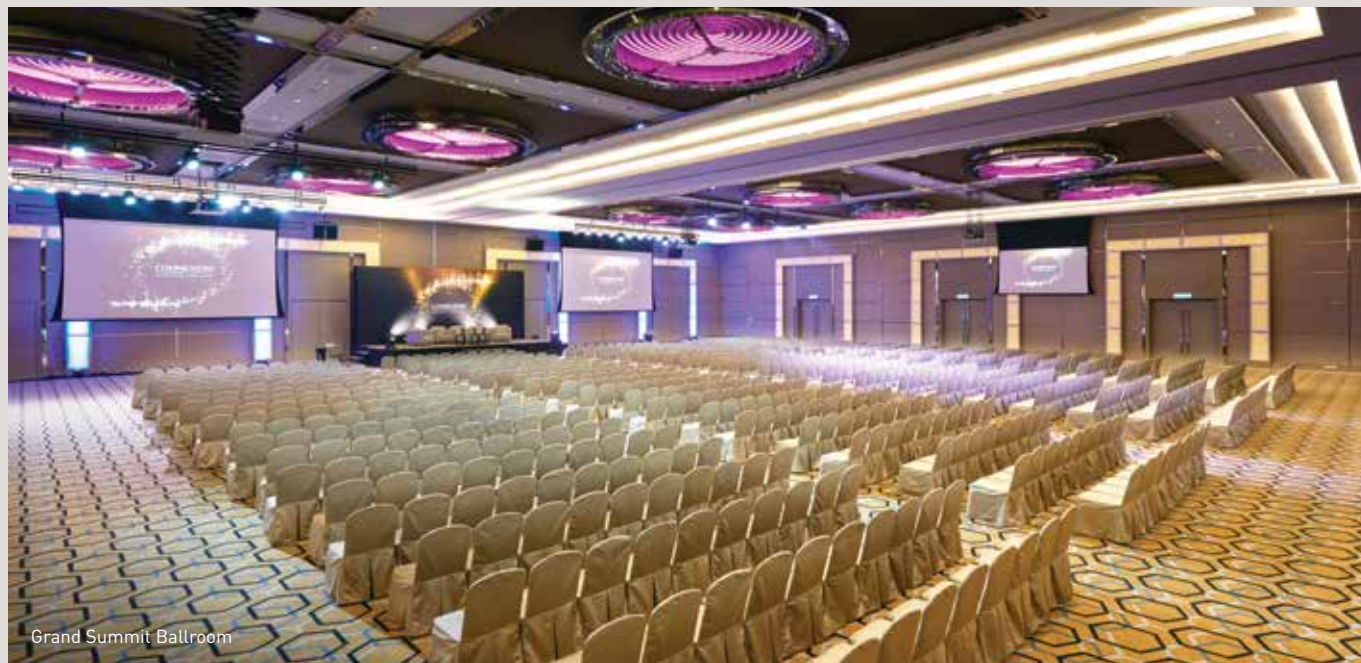
Grand Summit Ballroom