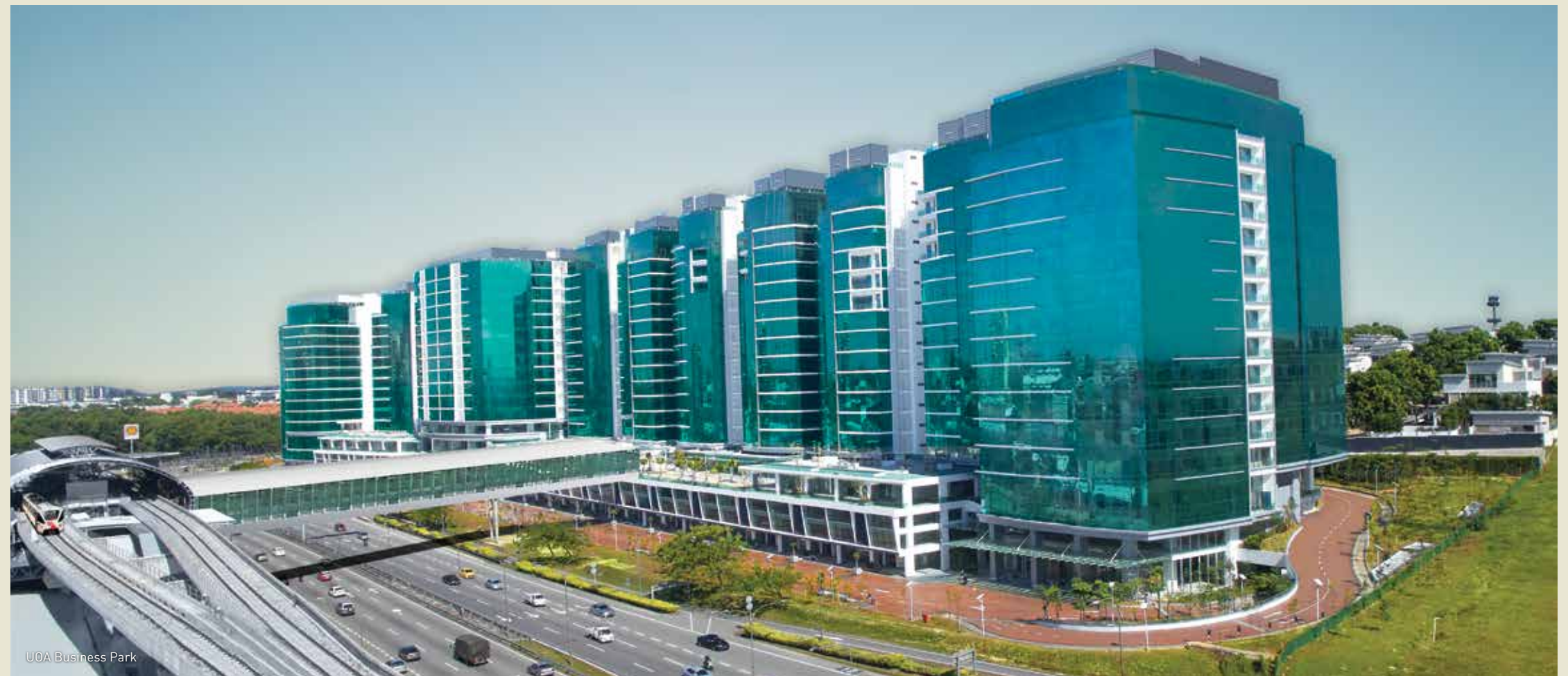
UOA Business Park

📄 www.uoa.com.my/property/commercial/lease/uoa-business-park