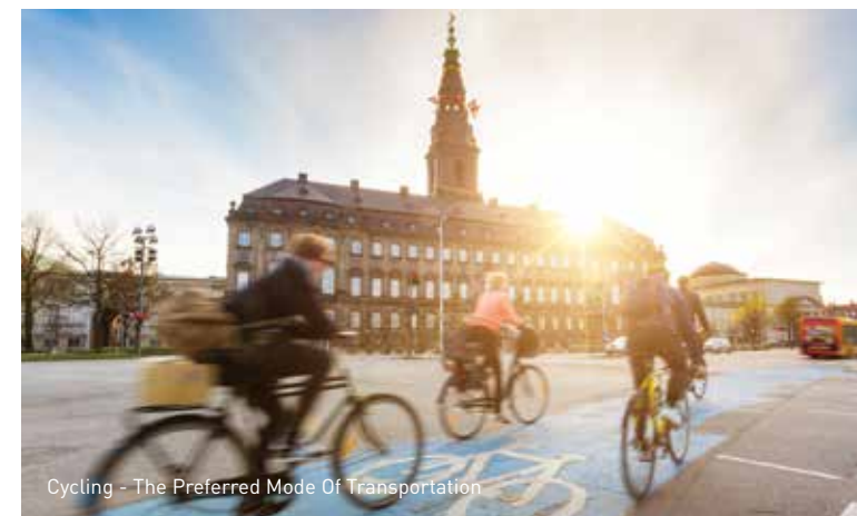
Cycling - The Preferred Mode Of Transportation

Here, we take a look at a handful of happy highlights about Copenhagen and what makes it a must-visit on your list of travel destinations.