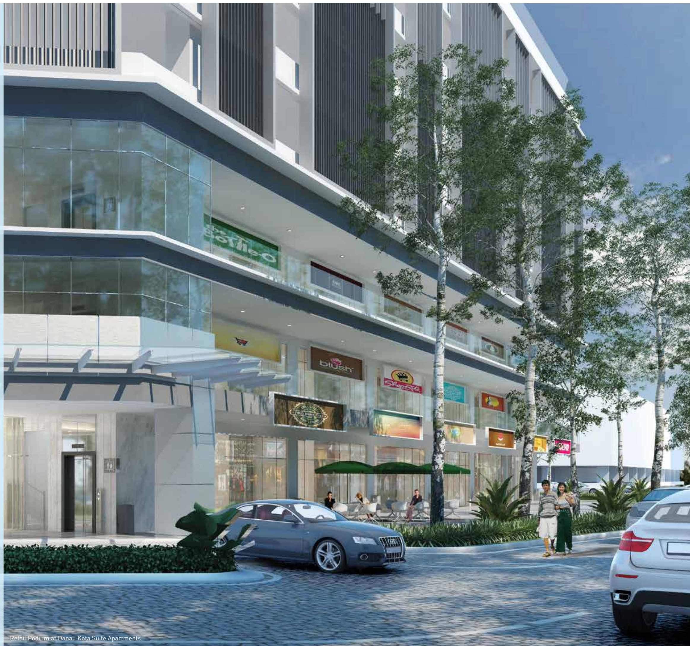
Retail Podium at Danau Kota Suite Apartments

On that note, we would like to wish you an exceptional and wonderful year ahead!