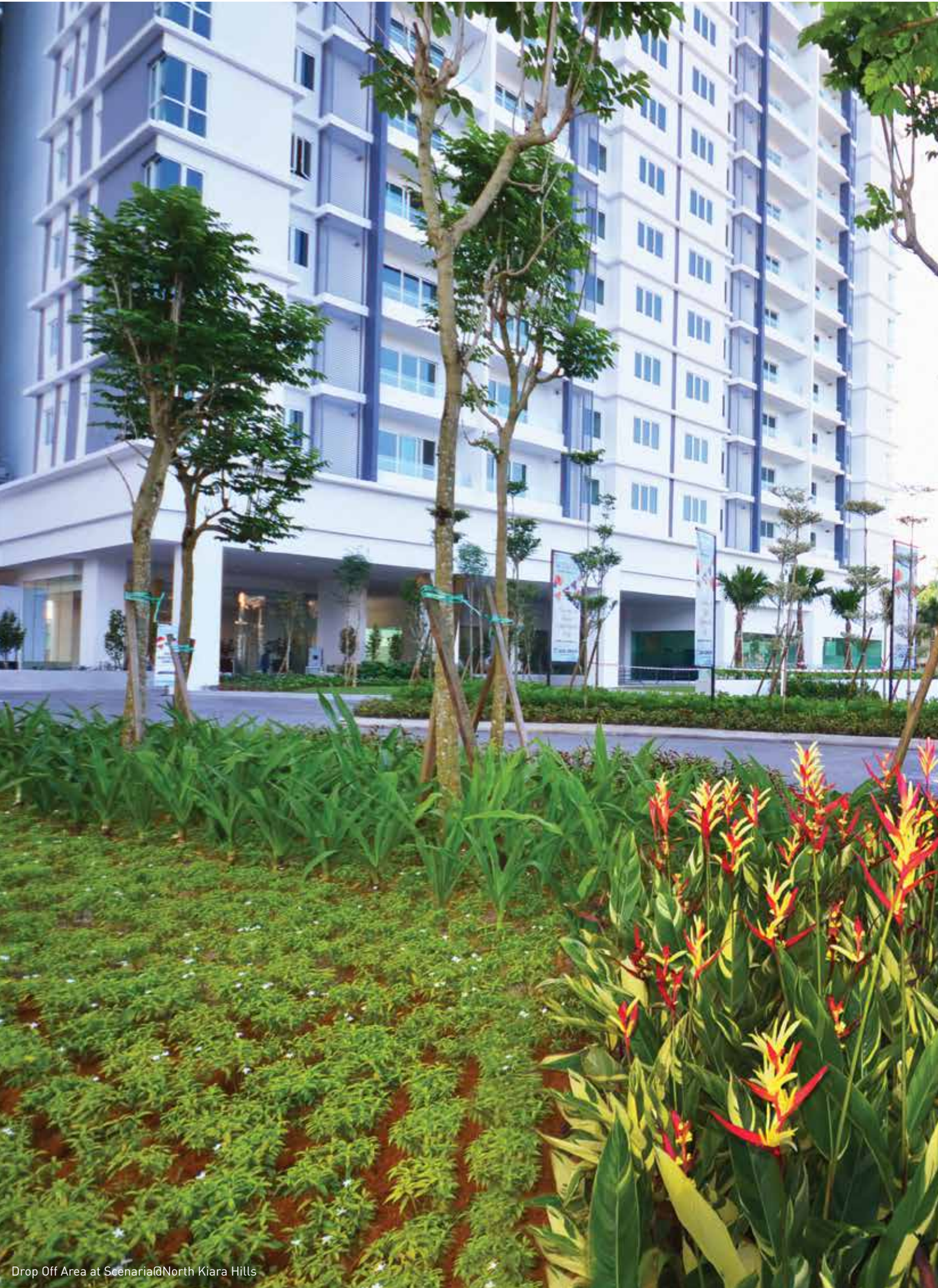
Drop Off Area at Scenaria@North Kiara Hills

Printer: Oscar Press Sdn Bhd No. 29, Jalan Tago 11 Taman Perindustrian Tago Bandar Sri Damansara 52200 Kuala Lumpur Malaysia