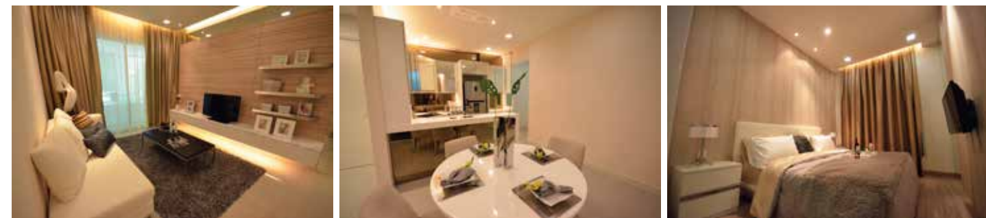
Actual Photos Of Show Unit